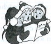
singing Christmas carols