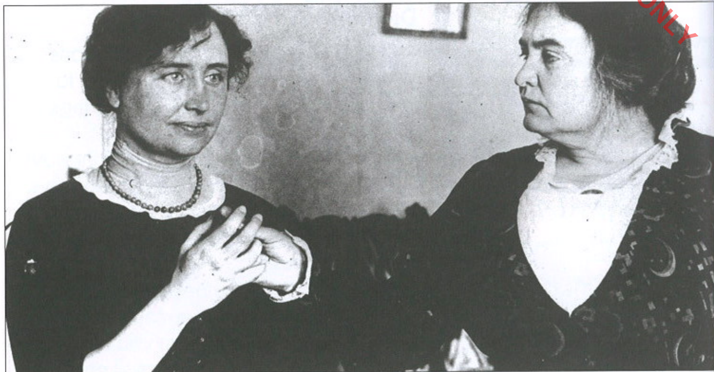
Helen Keller (left) and Anne Sullivan, her teacher

Helen Keller was born in 1880. When she was one, she got sick. After that, she could not see, hear, or talk.