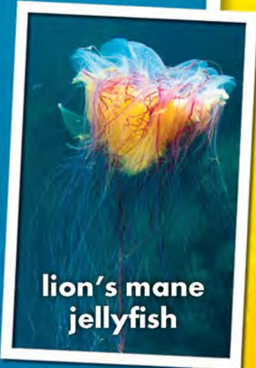
lion's mane jellyfish