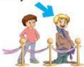
in front of