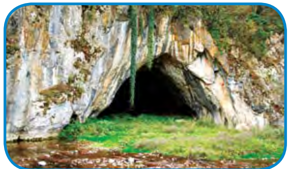
c a v e