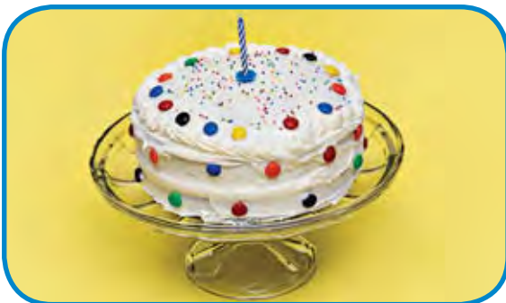
c a k e