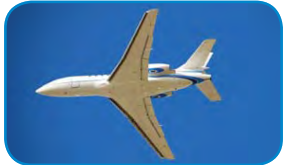
p a n e