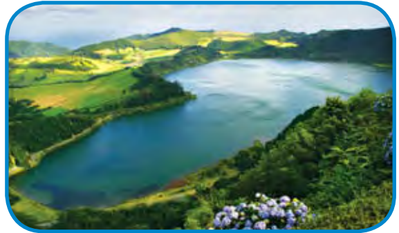
l a k e