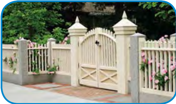
g a t e