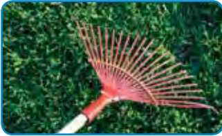
r a k e