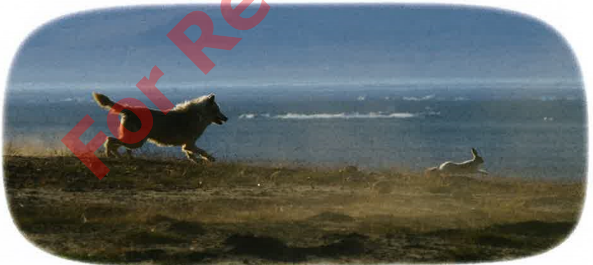
Arctic wolves hunt Arctic hares for food.