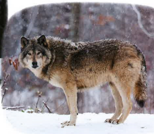
The timber wolf has a darker coat than the Arctic wolf.