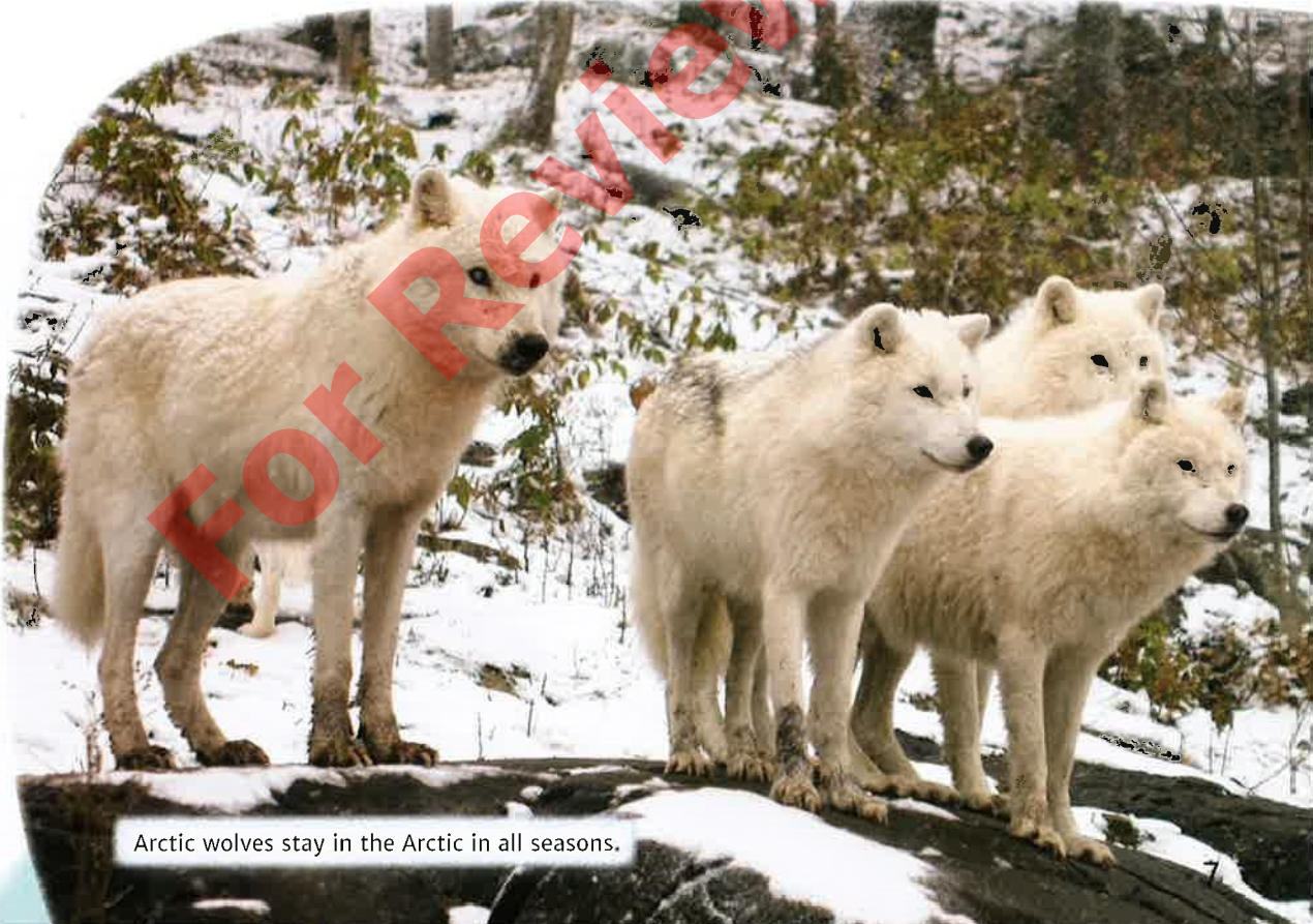
Arctic wolves stay in the Arctic in all seasons.