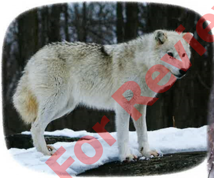
The Arctic wolf's pale coat makes it hard to see in the snow.

Arctic wolves have a very thick white or pale-grey coat. Arctic wolves also have shorter ears and noses than timber wolves. They have lots of fur between the pads on their paws, too. These things help them to keep warm in the freezing Arctic weather.