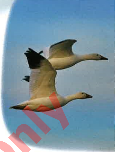
Snow geese fly south away from the Arctic for the winter.

The wolves continue to hunt for food during the coldest parts of winter.