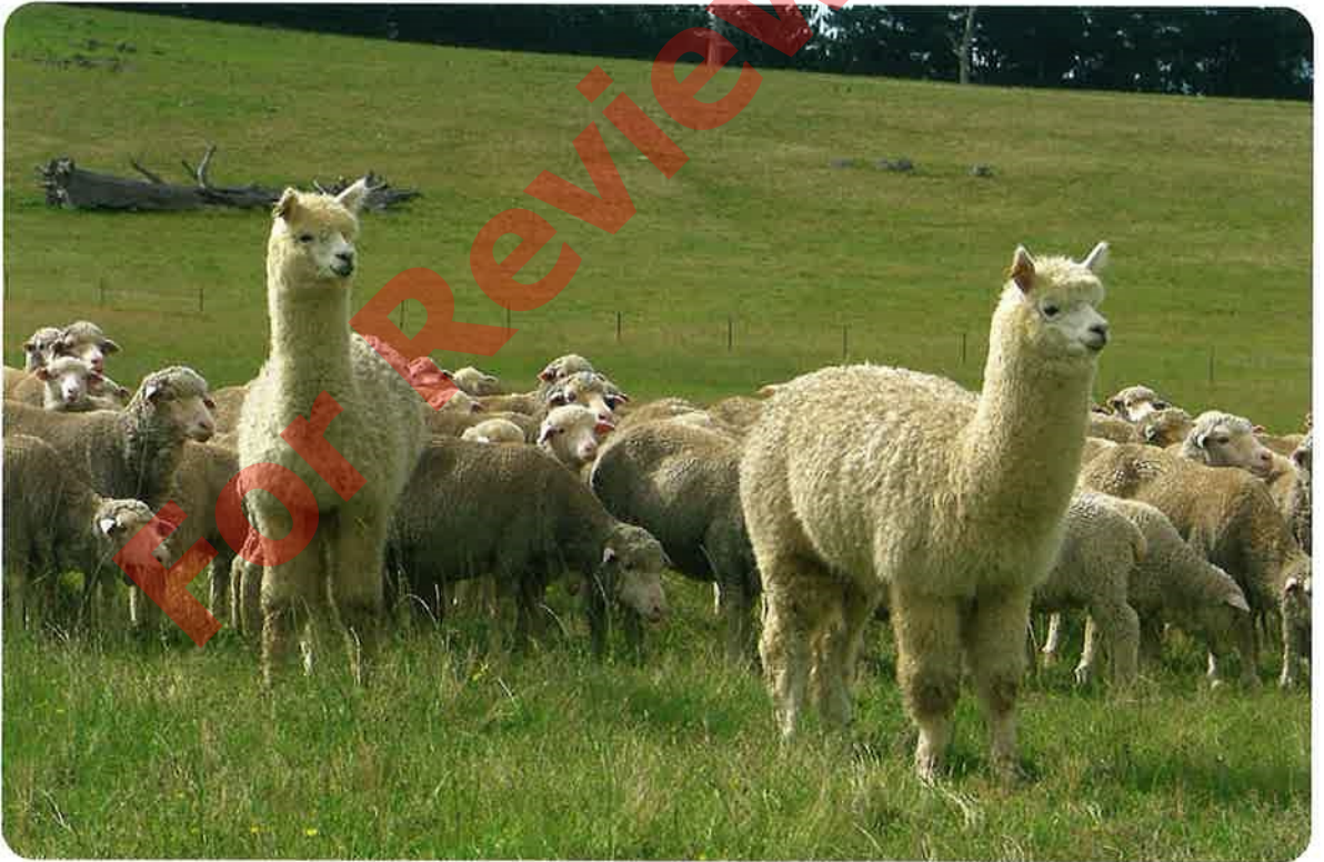
Alpacas and sheep live together in this herd.

Alpacas often live in a herd, on an alpaca farm. Sometimes, they live with sheep and goats. Alpacas can help keep sheep and goats safe from other animals like foxes. Alpacas will squeal at the animals and chase them away!