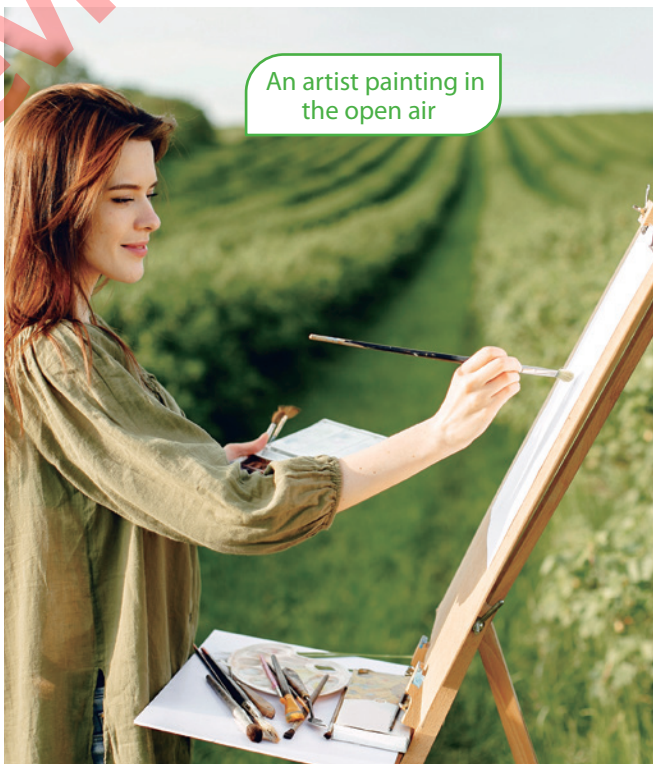
An artist painting in the open air