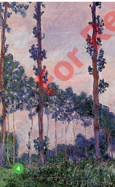
Three Trees in Gray Weather by Monet (1891)