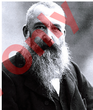
A photo of Claude Monet

Claude Monet was a famous French painter. He is known for painting in the open air (outside).