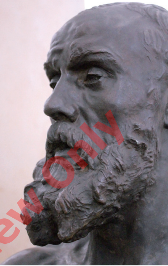
← Jean-Paul Laurens—an early bust by Rodin (1881)

Rodin was different from many artists. He was not famous until he was 40 years old. However, he started to improve at art as a teenager.