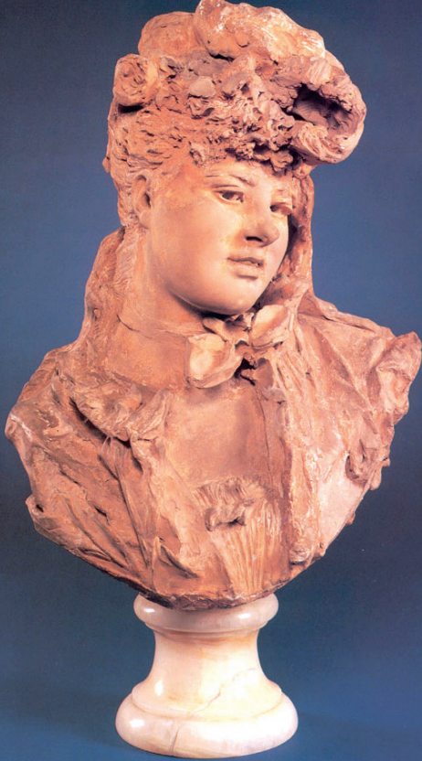
← Bust of a Smiling Woman by Rodin (1875)