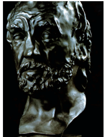
Man with a Broken Nose → by Rodin (1864)

Rodin was different from many artists. He was not famous until he was 40 years old. However, he started to improve at art as a teenager.