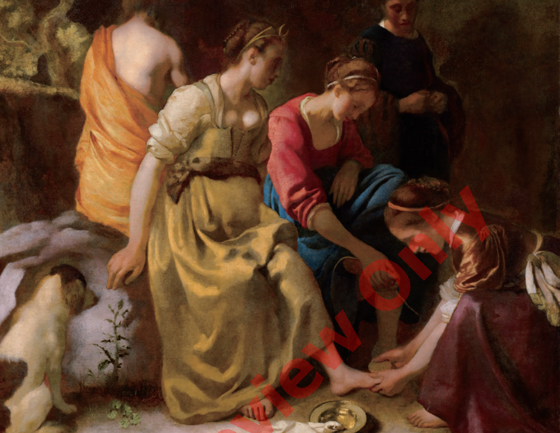
Diana and Her Companions by Vermeer (c. 1654)

You can see both of these styles in Vermeer's early works. We don't know where Vermeer trained. However, people think artists from the Utrecht School inspired Vermeer.