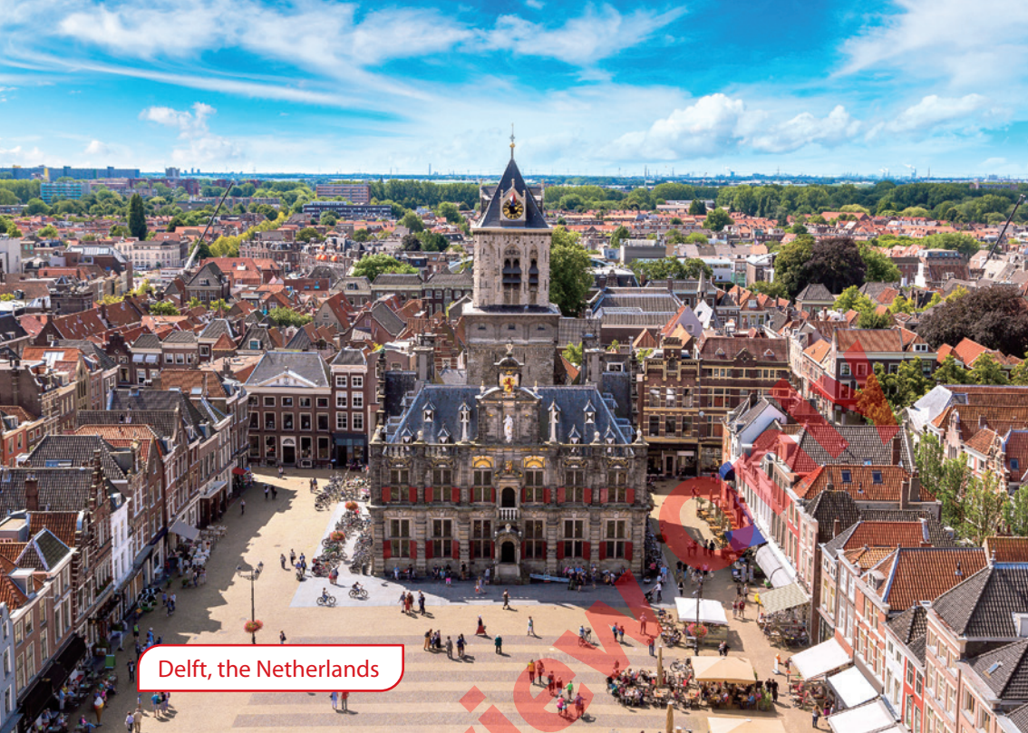
Delft, the Netherlands

However, Vermeer didn't just work at the family businesses. He became a painter, too. In 1653, he registered as a master painter in Delft.