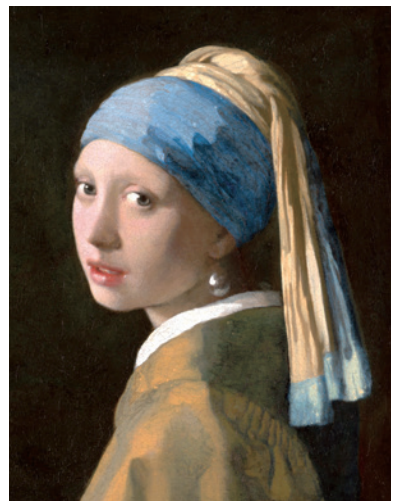
↗ Girl with a Pearl Earring by Vermeer (1665)

Vermeer started painting in the early 1650s. At first, he painted stories from the Bible or from myths. Later, he began painting everyday life. These became his most famous works. Girl with a Pearl Earring is one of these.