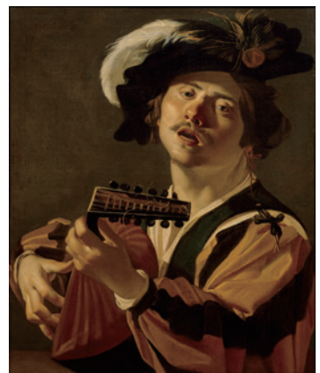
The Lute Player by Dirck van Baburen (1622)—a painter from the Utrecht School

You can see both of these styles in Vermeer's early works. We don't know where Vermeer trained. However, people think artists from the Utrecht School inspired Vermeer.