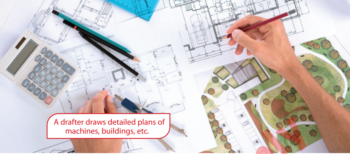
A drafter draws detailed plans of machines, buildings, etc.