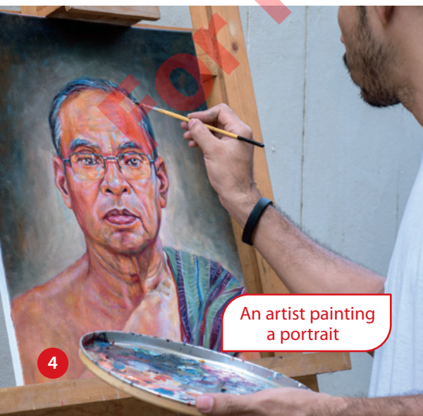
An artist painting a portrait