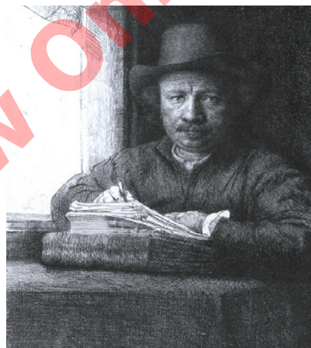
An etching by Rembrandt (1632)

Rembrandt was not just a gifted painter. He was also a great drafter, etcher, and printmaker.