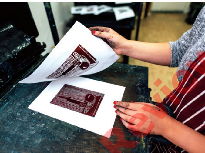
A printmaker is someone who prints pictures or designs on something, like paper!