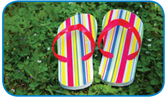
f lip f lops